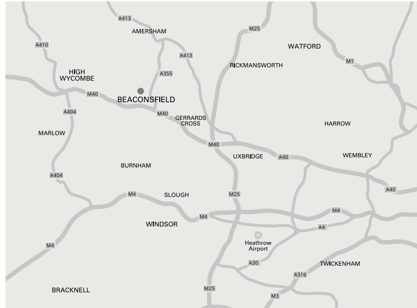
Map not to scale – indicative only.

Set within South Buckinghamshire, Beaconsfield is regarded as a highly desirable commuter town, within 20 minutes of London Heathrow, yet surrounded by picturesque and scenic countryside. Beaconsfield lies close to the intersection of the M25 and the M40, giving the town excellent motorway links, while the A40 provides direct access to central London. Beaconsfield train station offers a journey time to London Marylebone from approximately 24 minutes*.